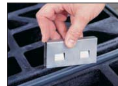
Easy-to-install Joining Clip

By joining centers together with the patented Sump-to-Sump™ Drain Kit for a total 66-gallon sump capacity, you will meet EPA and UFC requirements.