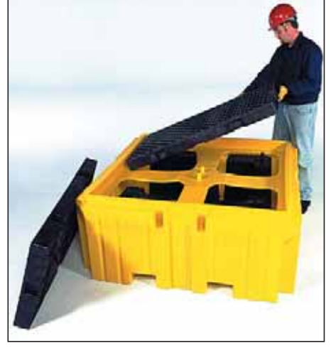
Five inner polyethylene columns support uniformly distributed loads of up to 8,500 lbs. All components are easily removed for cleaning.