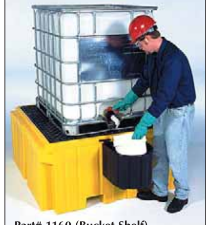
Part# 1160 (Bucket Shelf)

Spills from dispensing that exceed 3 gallons are channeled into the 360-gallon sump through a bulkhead fitting.