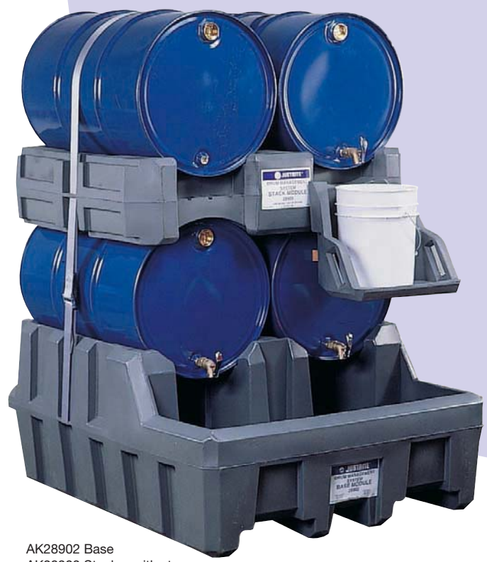
AK28902 Base AK28903 Stacker with strap AK28904 Shelf