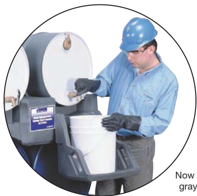
AK28904 Dispensing Shelf reduces the risk of spills.