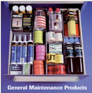
General Maintenance Products

For multiple shift applications the warranty is: three years for two shifts – one year for three shift applications.