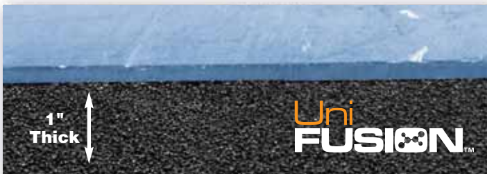
RESULTS from INDEPENDENT TEST LABS & PRESENTED as COMPARISONS to OTHER NOTRAX® INDUSTRIAL MATS