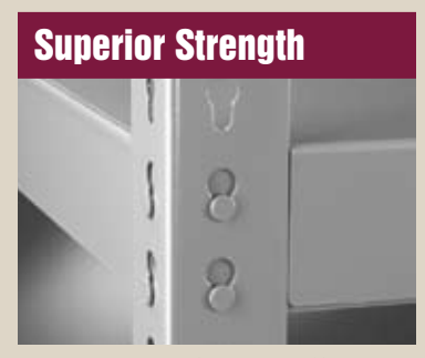
Our rivet attachments offer superior strength to shelving and with no need for nuts and bolts, it makes assembly a snap!