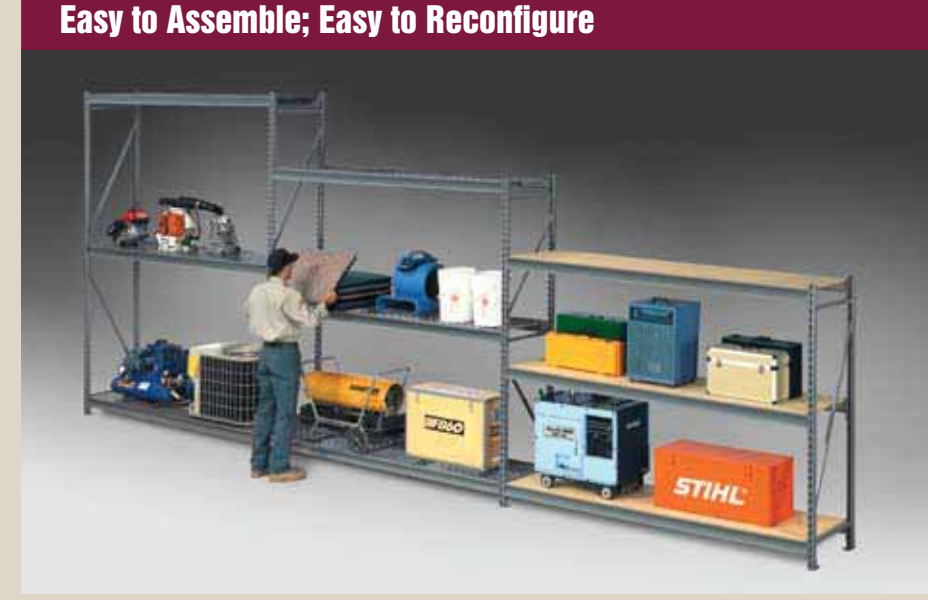
Tennsco Bulk Shelving offers easy adjustability and expandability to fit your specific storage needs for today AND tomorrow.