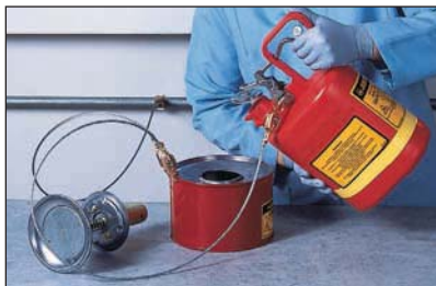
Grounding with antistatic wires

Patented, conductive, current-carrying carbon insert embedded into the rib of the container completes a grounding path between the cover assembly and the flame arrester in the spout. When used with antistatic wires, this provides proper grounding and prevents the creation of an arc during filling or pouring.