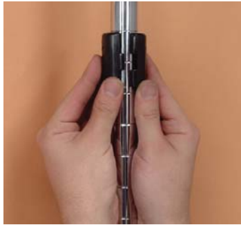
1. Snap plastic sleeve around post.

Assembling Wire Shelving Units is easy as 1-2-3!