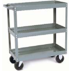
3 Shelf Cart 1630-3HD