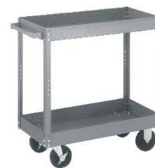
2 Shelf Cart 1630-2