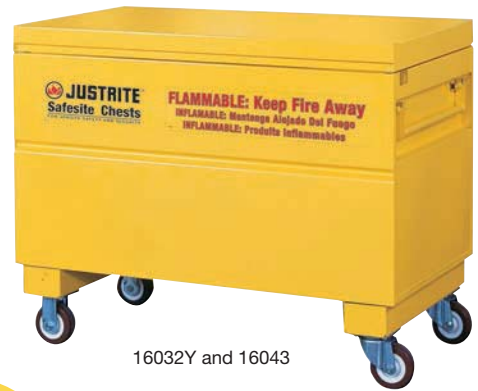
16032Y and 16043

Safesite™ Safety Chest is made with double-wall construction throughout for the storage of flammables.