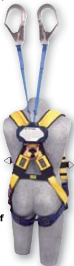
Talon™ Twin Leg Self Retracting Lifeline 6' (1.8m) 3102000