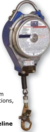
Sealed Self Retracting Lifeline 50' (15m) cable 3403400