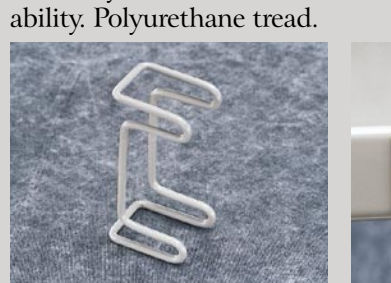
Use ledge clips to affix back Identify shelf contents for ledges to shelves when side inventory control and ease height past 86<sup>3</sup>/<sub>8</sub>". ledges aren't used.