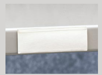
Plastic label holder of locating.