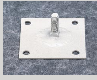
Foot plate Use to bolt unit to floor for permanent installation.