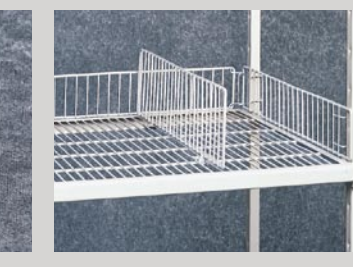
Dividers Back and side ledge dividers prevent "rolloff" while shelf dividers organize space.