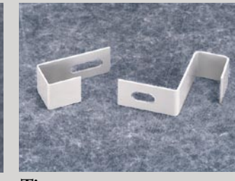
Ties Use back to back ties to link units together for stability. Wall ties permit wall anchorage.