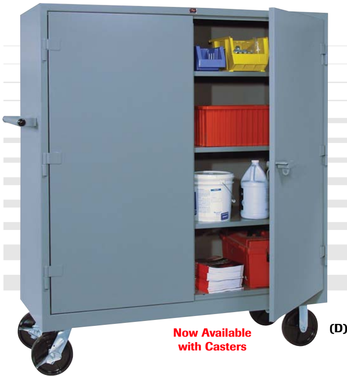
Now Available with Casters (D)