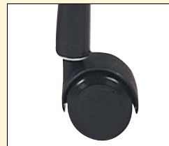
2162 Caster – Braking caster brakes when seat is not occupied. Fits 2020, 2030 series.