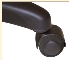
2165 Caster – Reverse braking caster brakes when seat is occupied. Fits 2016, 2040, 2080 series.