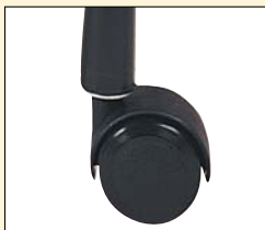
2164 Caster – Reverse braking caster brakes when seat is occupied. Fits 2020, 2030 series.