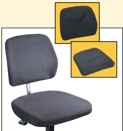
2172 Slip Cover – Padded foam slip cover. Durable nylon fabric. Fits large Polyurethane backrest only.