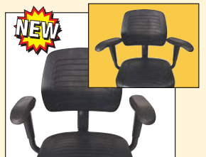
2077N Arms – Adjustable Polyurethane arm pads rotate 30°. Designed for 1990, 1991 chairs. Also fits, 2024N, 2034N, 2044N, 2084N, 2044TC, 2043CRN chairs.