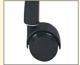
2061 Casters – Industrial Caster adds 2" height. Fits 2020, 2030 series.