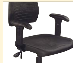
2076N Armrest – "T" Pad adjustable armrests. Fits 2006, 2016, 2026, 2036, 2046 chairs. 2076ESD Armrest – "T" Pad adjustable armrests. Fits 2056N chair.