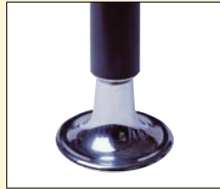
2160 Glides – Large steel glide with 2 1/2" diameter. Fits 2020, 2030 series.