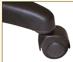
2064N Caster – Hard floor caster adds 1" height. Fits 2016, 2040, 2080 series.