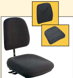
2174 Welding Cover – Fits 2024, 2034, 2034X, 2044 chairs.