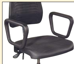
2067N Armrest – Loop armrest assembly. Fits 2025, 2026, 2035, 2045, 2085 chairs. 2068 Armrest – Loop armrest assembly. Fits 2006, 2016, 2036, 2046, chairs.