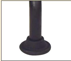
2066N Glides – Industrial glide with 2 3/4" diameter. Fits 2020, 2030 series.