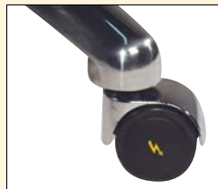
2071CR Caster – Hard floor conductive caster adds 1" height. Fits 2040CR, 2050ESD series.