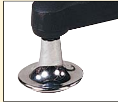
2161 Glides – Large steel glide with 2 1/2" diameter. Fits 2016, 2040, 2050, 2080 series.