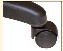
2163 Caster – Braking caster brakes when seat is not occupied. Fits 2016, 2040, 2080 series.