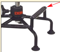
2080N Footrest – High footrest. Fits 2030 series.

Sold in sets. Material is Denier Nylon Cordura.