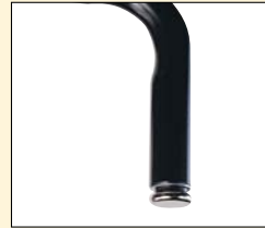
2166 Glides – Small steel glide fits 2020, 2030 series.