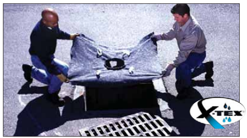
U.S. Patent No. 5,575,925