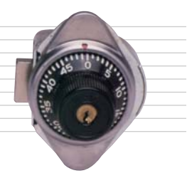
Built-in Master-Keyed Combination