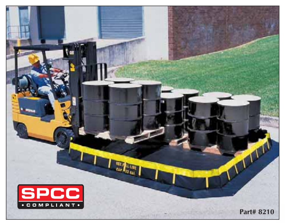
Perfect for containment of drums in remote areas. 10' x10' Containment Berm holds up to 16 drums.

Stake Wall Model Containment Berms feature a unique design that allows the sidewalls to collapse in either direction and spring back automatically to their upright position! Roll drums over the sidewalls, drive trucks through them, and the sidewalls always return to vertical without assistance.