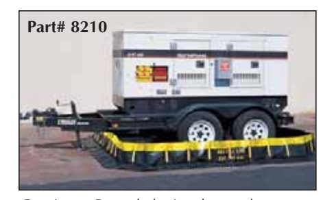
Containment Berms deploy in only seconds, no assembly required... excellent for off-site containment