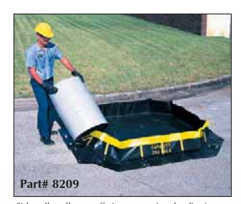
Sidewalls collapse, offering convenient loading/ unloading on remote locations.