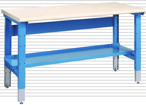
Work Station with Stringer and Shelf