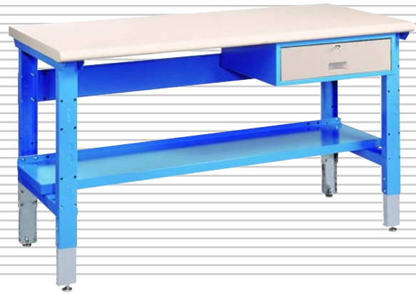
Work Station with Stringer, Shelf and Utility Drawer