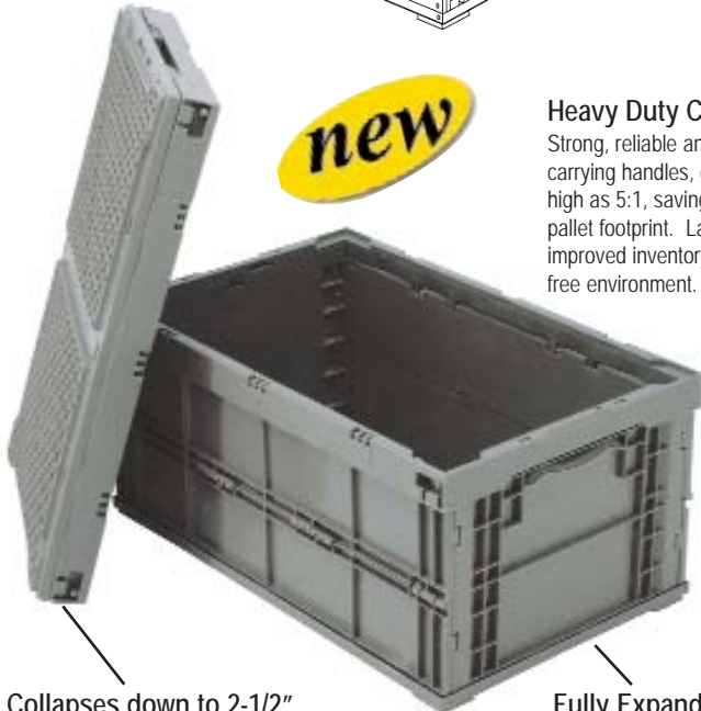
Collapses down to 2-1/2"