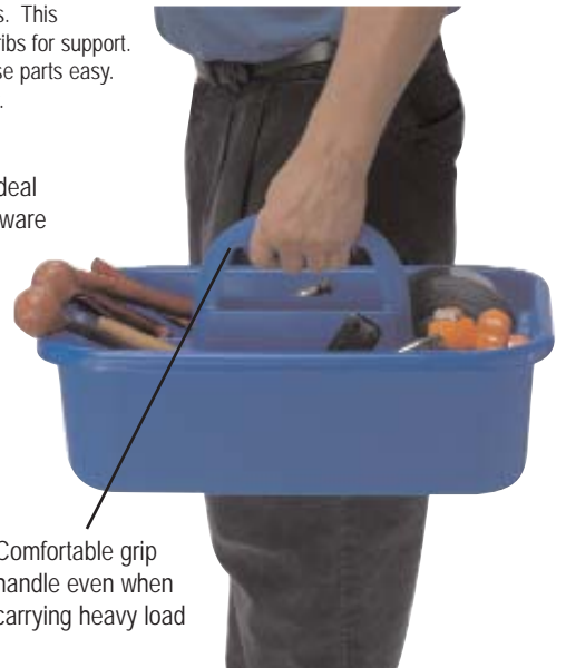
Comfortable grip handle even when carrying heavy load