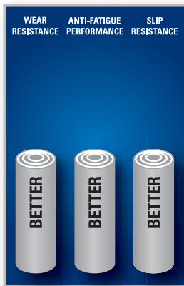
RESULTS from INDEPENDENT TEST LABS & PRESENTED as COMPARISONS to OTHER NoTRAX® FOOD SERVICE MATS