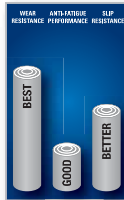
RESULTS from INDEPENDENT TEST LABS & PRESENTED as COMPARISONS to OTHER NoTRAX® INDUSTRIAL MATS