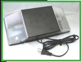
Specify suffix "WC" to receive the R-2 with cord and plug.