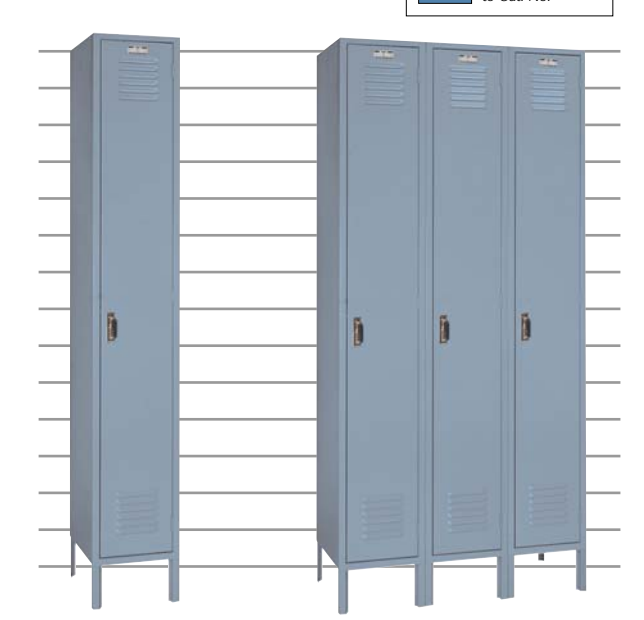
Order one No. 5002 and receive This one section, one frame wide (one locker opening).