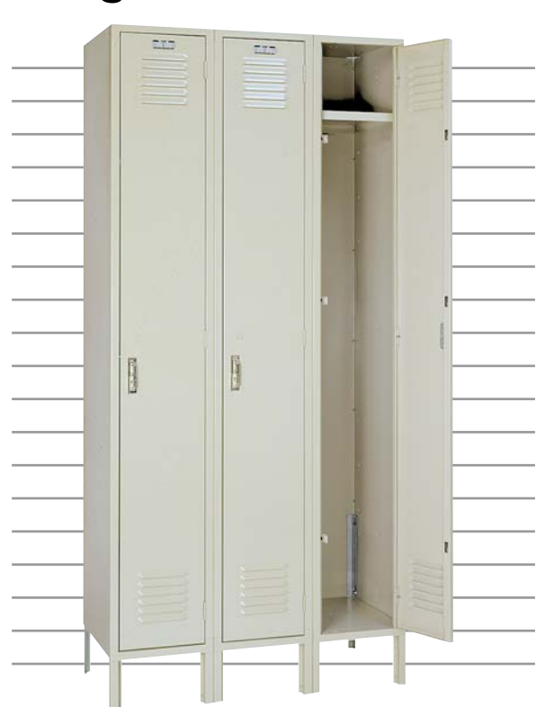
No. 5112-3 - One single tier locker section, three frames wide (three locker openings).

NOTE: In the interest of safety, Lyon strongly recommends that lockers be floor and/or wall anchored. See page 88 for important locker anchoring information.