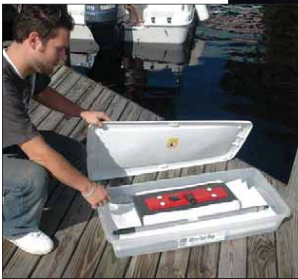
Optional Ultra-Fuel Mop Drip Tray (Part# 3307) provides convenient storage for Mop and Pads.