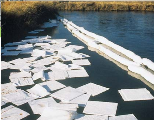
Ideal for outdoor use — MeltBlown Mat provides quick, efficient cleanup to help protect the environment from contamination.