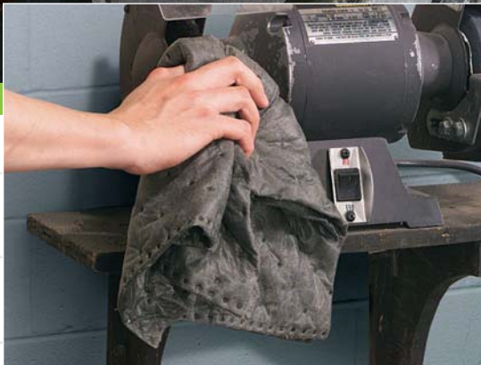
AirLaid Mat crumples and conforms to better suit your tight sorbent or wiping application.