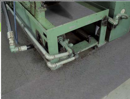
Fast-acting SonicBonded Mat starts absorbing on contact. It's the best choice for overspray and soaking up spills.