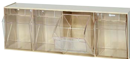
QTB304 4 Bin - 6-5/8"L x 23-5/8"W x 8-1/8"H