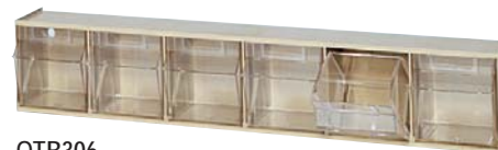
QTB306 6 Bin - 3-5/8"L x 23-5/8"W x 4-1/2"H