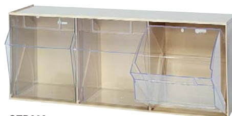
QTB303 3 Bin - 7-3/4"L x 23-5/8"W x 9-1/2"H