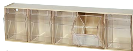
QTB305 5 Bin - 5-1/4"L x 23-5/8"W x 6-1/2"H