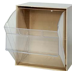
QTB301 1 Bin - 11-3/4"L x 11-13/16"W x 13-7/8"H