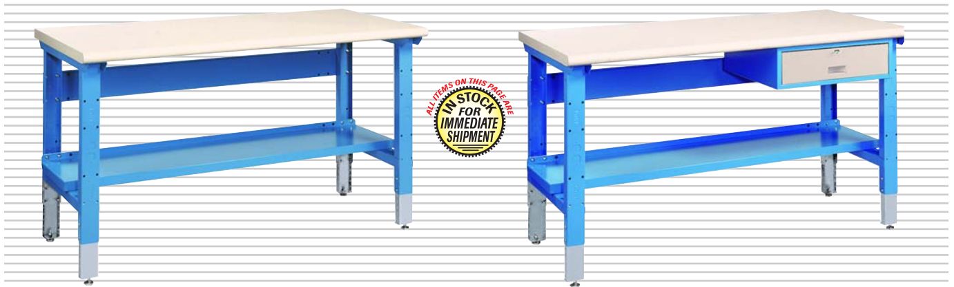
ESD Work Station with Stringer and Shelf

See page 128 for additional information.