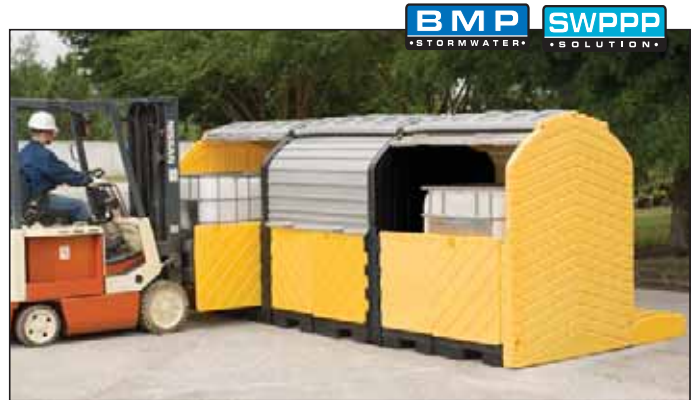
3-Tank Model: 355 Gallon Capacity (Part# 1166)