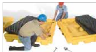
Pallet to Pallet connection