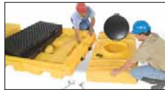
Pallet to Expansion Tank connection