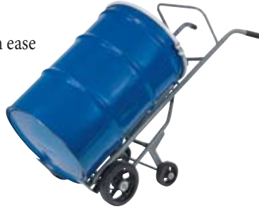
Cradle Combo Truck