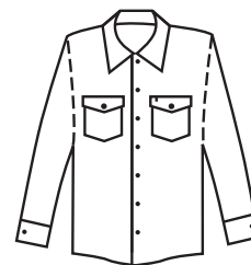
Long Sleeve Shirts