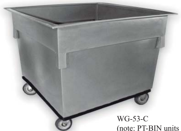
WG-53-C (note: PT-BIN units have straight sidewalls)

Rolling carts built to haul really big loads. Molded bins are heavy-duty polyethylene, mounted on all-welded steel dolly with 5" casters mounted in the corners. PT-BIN2-C has an optional lid available.