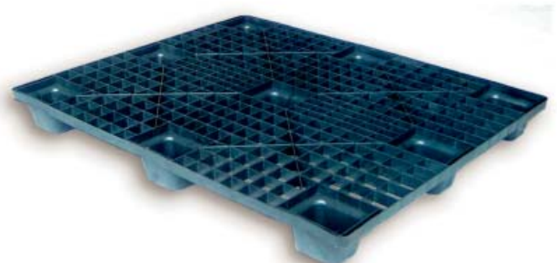
EXP1210-MD Medium-duty pallet made for shipping and reuse