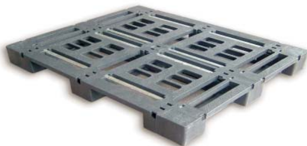
RX-4840 Heavier version of the standard S-4840. The picture above shows optional steel bars to allow heavy-duty use on unsupported racking