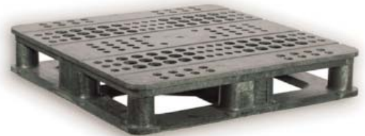
PF-3636 (PF-3737 similar) Beverage & Display pallet

NOTE: EXP (export) pallets are designed mainly for shipping purposes. Three versions in three different materials are offered, with the LD (light duty - not shown) version made for one-way export shipping only.