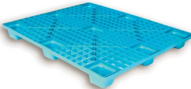
EXP1210-HD Heavy-duty shipping pallet can be reused as needed

NOTE: EXP (export) pallets are designed mainly for shipping purposes. Three versions in three different materials are offered, with the LD (light duty - not shown) version made for one-way export shipping only.