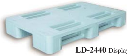
LD-2440 Display pallet