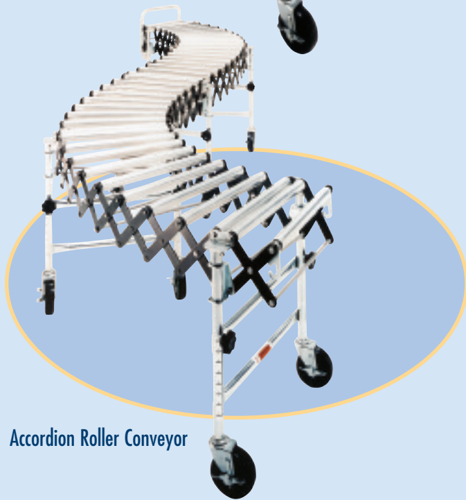
Accordion Roller Conveyor