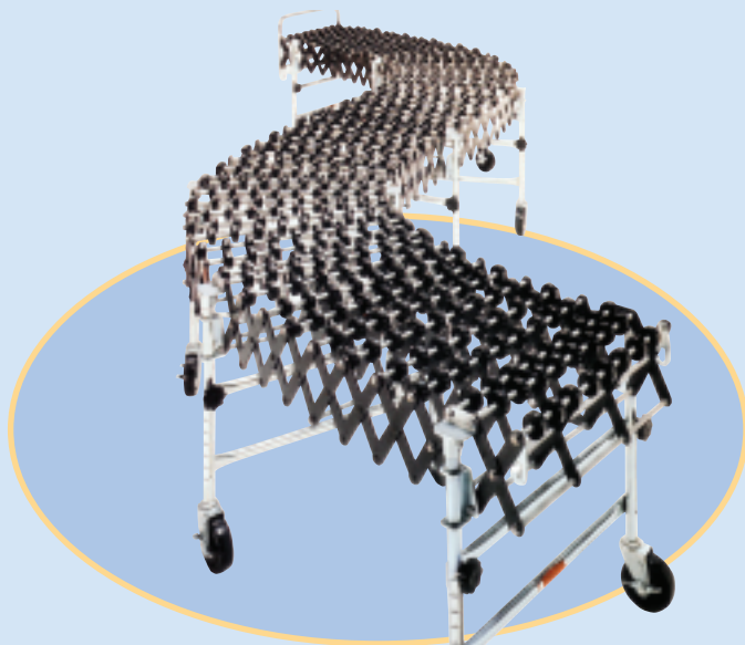
Accordion Wheel Conveyor