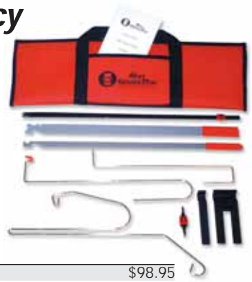
AJ581 Emergency Tool Kit $98.95