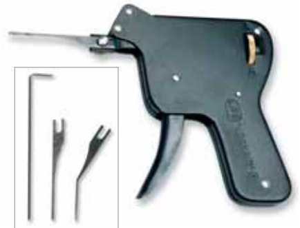
T671X The Lockaid® Tool $51.95

Specifically designed to pick pin tumbler locks. Guaranteed for life if defective or broken during normal use. Complete tool kit consists of the tool itself, offset needle, straight needle (.025"), straight needle (.035"), tension wrench, and registration card. Ship. wt. 1 lb.