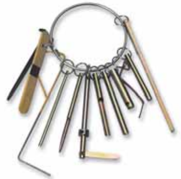
AC820 Elevator Key Set $199.95

Manufactured to conform with the majority of elevator manufacturer's access keys. This convenient set of quality keys consists of: volt-resistant key with 5,000-volt resistance of spring steel; swing door access key; rib key "T" style; vandal-proof access key; half-moon key (large); half-moon key (small); drop key, adjustable; side exit key; "Z" key round stock; knife key with "T" handle; shove knife; kerry key. Set comes on a large jailers ring for easy storage and use. Split ring for easy removal. Ship. wt. 1 lb.