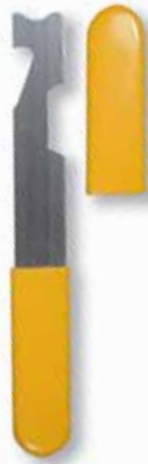
AH164 Shove Knife $5.95

The fastest, damage-free means of opening residential, office interior doors with key in the knob locks. Works from either side of the door. If the door opens inward, you shove the knife in back of the molding stop and retract the latch. For doors that open towards you, the knife is slipped in from above or below the latch point, jiggled and pulled to retract the latch. Ship. wt. 1 lb.