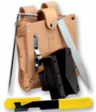
T986 K-Tool Kit $139.95 BB062 R-Tool Kit $184.95

The R-Tool is designed to pull all types of lock cylinders too large for the K-Tool unit such as locks that extend out from the door and 1" round are easily pulled with the R-Tool. The R-Tool consists of: R-Tool, Nylon carrying case, set of lock tool keys and a shove knife.