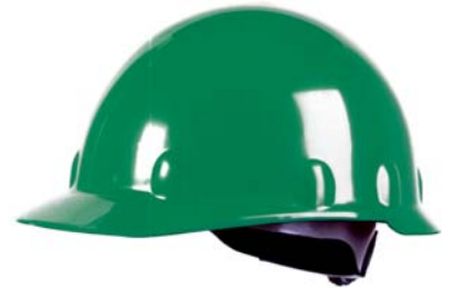
MODEL SE2 Sensor

Multi-directional protection. Meets ANSI-Z89.1 Type II Class E.