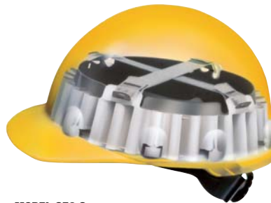
MODEL SE2 Sensor

Meets ANSI-Z89.1 Type I Class E, G or C.