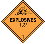
PLE13 Specify Group Letter

HAZARD CLASS 1.3 Placards for Compatibility Group C, F, G, H, J, K or L