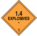
PLE14 Specify Group Letter

HAZARD CLASS 1.4 Placards for Compatibility Group B, C, D, E, F, G, or S