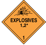
PLE12 Specify Group Letter

HAZARD CLASS 1.2 Placards for Compatibility Group B, C, D, E, F, G, H, J, K or L