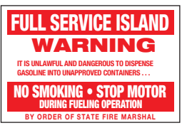
FSI-1014V 10" x 14" (vertical) FSI-1216V 12" x 16" (shown at left) VINYL ONLY