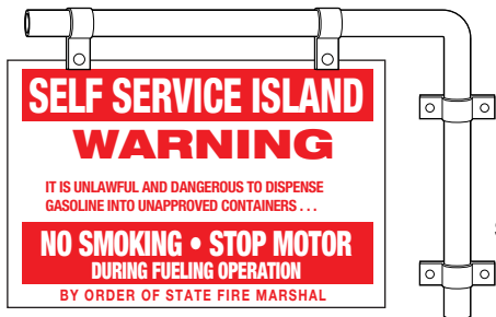
BRACKET BRK-1826 SOLD SEPARATELY