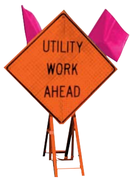
W2RKS-36 Includes mesh sign, ribs and stand