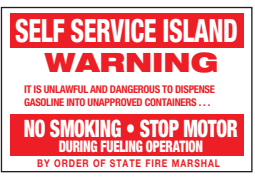
SSI-1014V 10" x 14" (vertical) SSI-1216V 12" x 16" (shown at left) VINYL ONLY