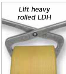
Lift heavy rolled LDH