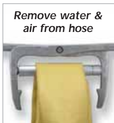
Remove water & air from hose