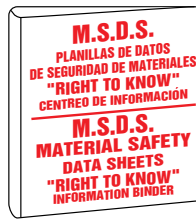
RTK-B-2B Bilingual RTK Binder

Economy version. Corrugated plastic with fold-up pocket. Binder/booklets not included.