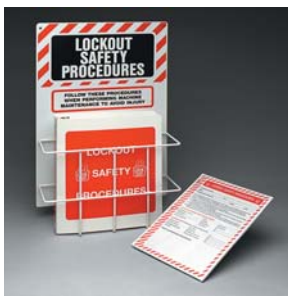
20"H x 14"W x 4 1/2"D