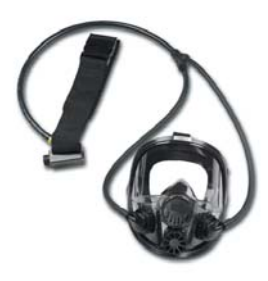
CF2007 shown with 7600 Series Full Facepiece