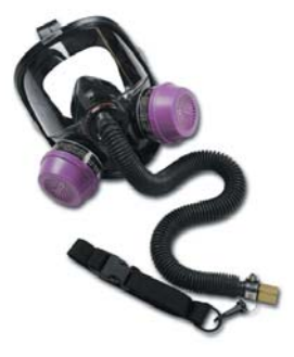
78005 shown with 7581P100 cartridges