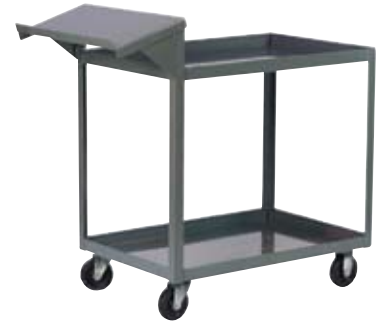
RMD25T5SR w/optional writing shelf