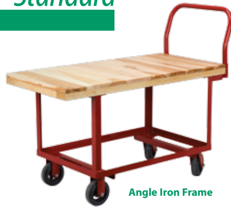
Angle Iron Frame