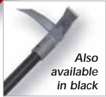
Also available in black