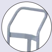
Flow Back (FB)