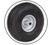
Full Pneumatic 10" x 3 1/2"