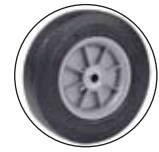
Semi-Pneumatic 10" x 2 3/4"