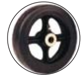
Mold-On Rubber 8" x 2"