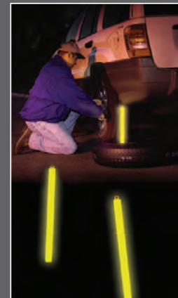
Lightsticks provide up to 2 hours of emergency lighting