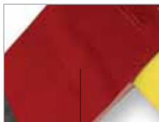
Contoured axe head holds claw of halligan tool