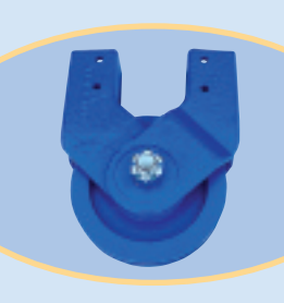
BOTTOM VERTICAL CORNER/MODEL 560: Bottom vertical also adjusts from 0° to 180°. Used to return product to higher level.