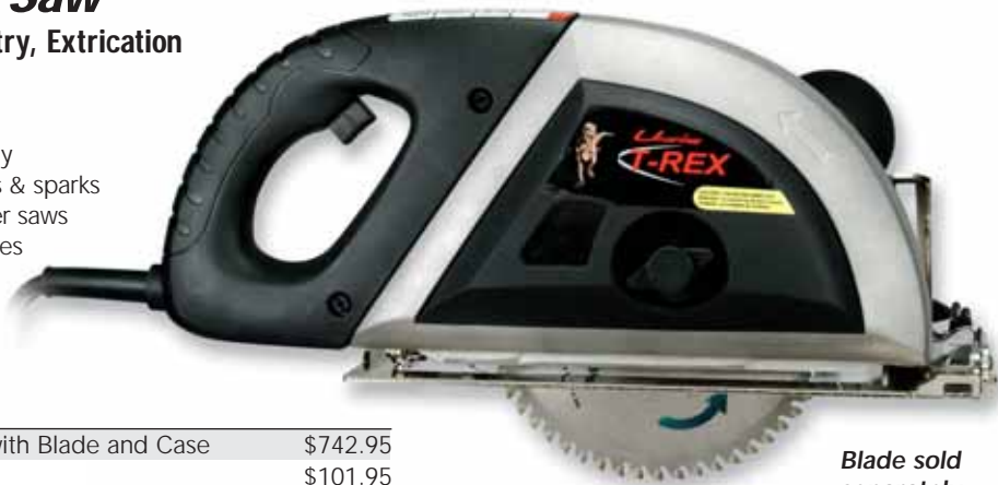
Blade sold separately