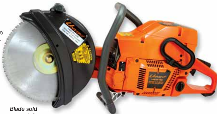
Blade sold separately