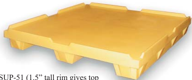
SUP-51 (1.5" tall rim gives top surface I.D. of 49.5" x 49.5")