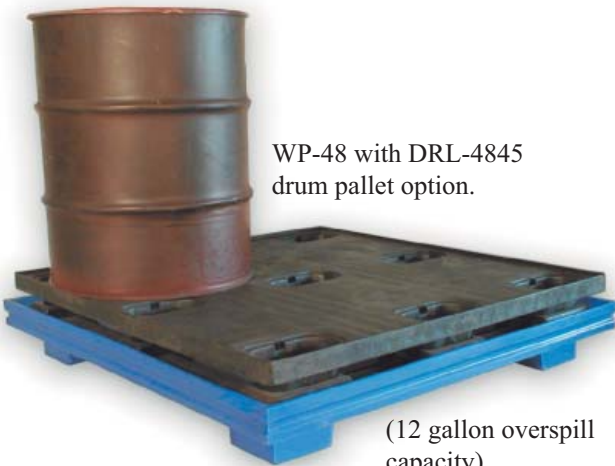
WP-48 with DRL-4845 drum pallet option.