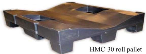
HMC-30 roll pallet