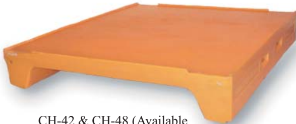
CH-42 & CH-48 (Available with rim as shown or flat-top)