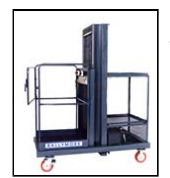
Model OP-10 *Shelf that raises not available